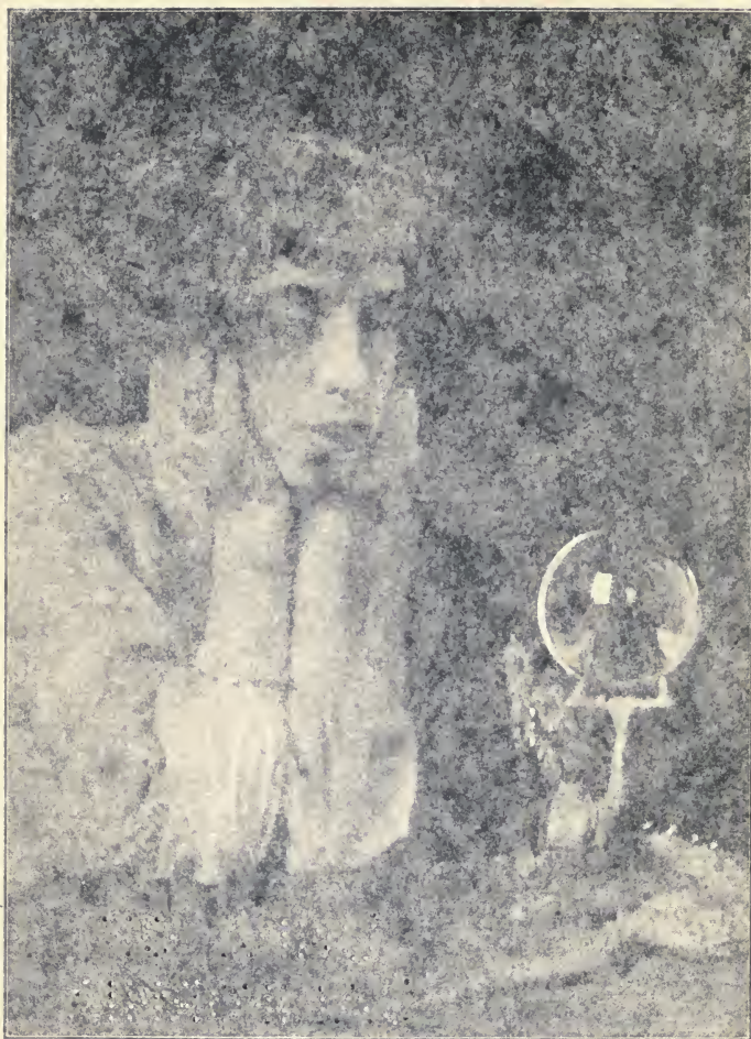
Globe and Stand lent by Dee & Furushima, Inc., N. Y.